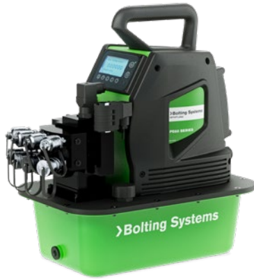
PE603BD1P - 115VAC, with LCD, 4-Tool