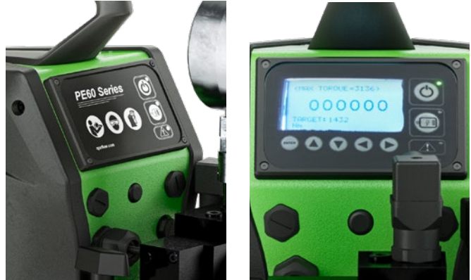
Standard Control Panel