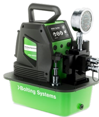
PE602BE1P - 230VAC, 1-Tool